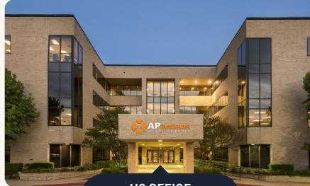
US OFFICE AUSTIN - USA