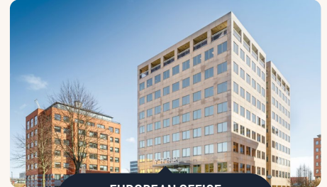
EUROPEAN OFFICE AMSTERDAM - NETHERLANDS