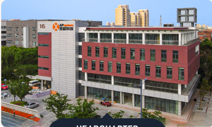
HEADQUARTER JIAXING - CHINA

the world. Invented in Silicon Valley in 2010, APsystems encompasses 4 global business units serving customers in more than 100 countries. With millions of units sold, producing more than 4 TWh of clean, renewable energy, APsystems continues to be a leader in the growing segment of large-scale solar equipment.